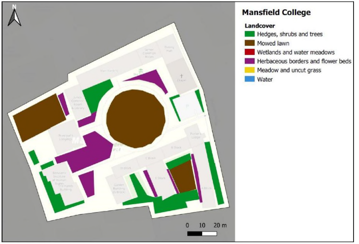
Figure 1. Land cover map.

Table 1. Asset register of estimated land cover types at Mansfield College